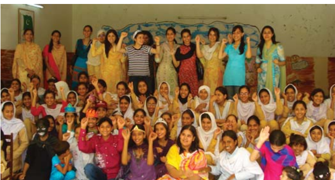
The merry TCF summer camp group, Lahore

At the end of the camp, volunteers arranged farewell parties at their respective schools and certificates were presented by TCF Principals to the volunteers.