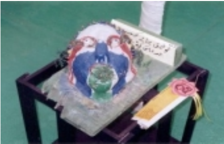
2nd Prize in the Junior Category