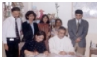
Unilever Pakistan signing its support.

We would also like to acknowledge the following Donations-in-Kind that helped enrich the lives of these deserving children and gave us a helping hand.