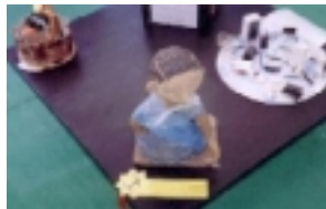
1st Prize in the Junior Category.