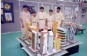
1st Prize in the Senior Category.

Unilever Pakistan organised their Annual International Art fest in mid-September this year and invited several schools of Pakistan to participate, including TCF. This time the theme was "Future World" and once again we are delighted to announce that out of the total of 17 entries, 5 were winners! TCF bagged the 1st and 2nd prizes in both the categories i.e. 5-10 years and