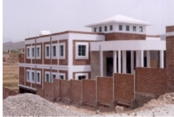
TCF Uthal Campus - another feather in our cap.

We are also happy to inform you that we will soon be adding a second TCF Teachers