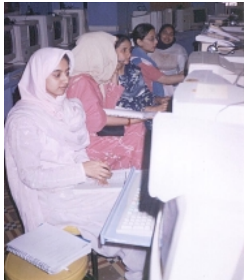
Teachers attending the Intel workshop.

It was a very fruitful and interesting experience for our teachers, who in turn will conduct similar workshops on how to use computers as a teaching tool that captivates, motivates and ultimately moves children towards greater learning experience.